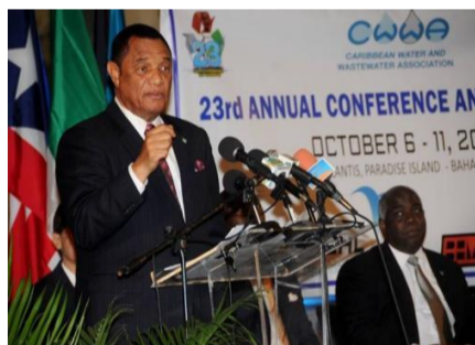
Bahamas Prime Minister, Honourable Perry Christie address the audience at the opening of the conference

Contributing to this unique event were 400 plus local and international Water, Waste and Solid Waste Practitioners, Technocrats, Engineers, Ministers and High Level dignitaries from across the Caribbean Region, the Americas and Europe. We are proud to have featured 60 Technical Sessions, 60 Exhibits and 4 specialized workshops lead by international experts on Risk Management and Natural Disasters; Water Climate Change and Health; Arbitration/Dispute Resolutions; and ABC Training/Certification for Water Utilities and their associated stakeholders..... Read more on page 6