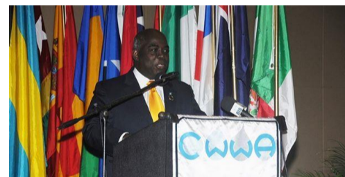
The Hon. Philip Davis, Deputy Prime Minister and Minister of Works and Urban Development of the Bahamas as he delivers a speech at the conference