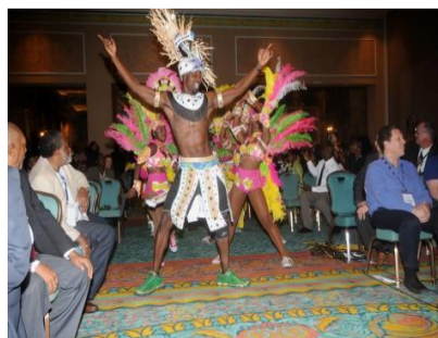
Bahamas showed off some of their culture at the opening