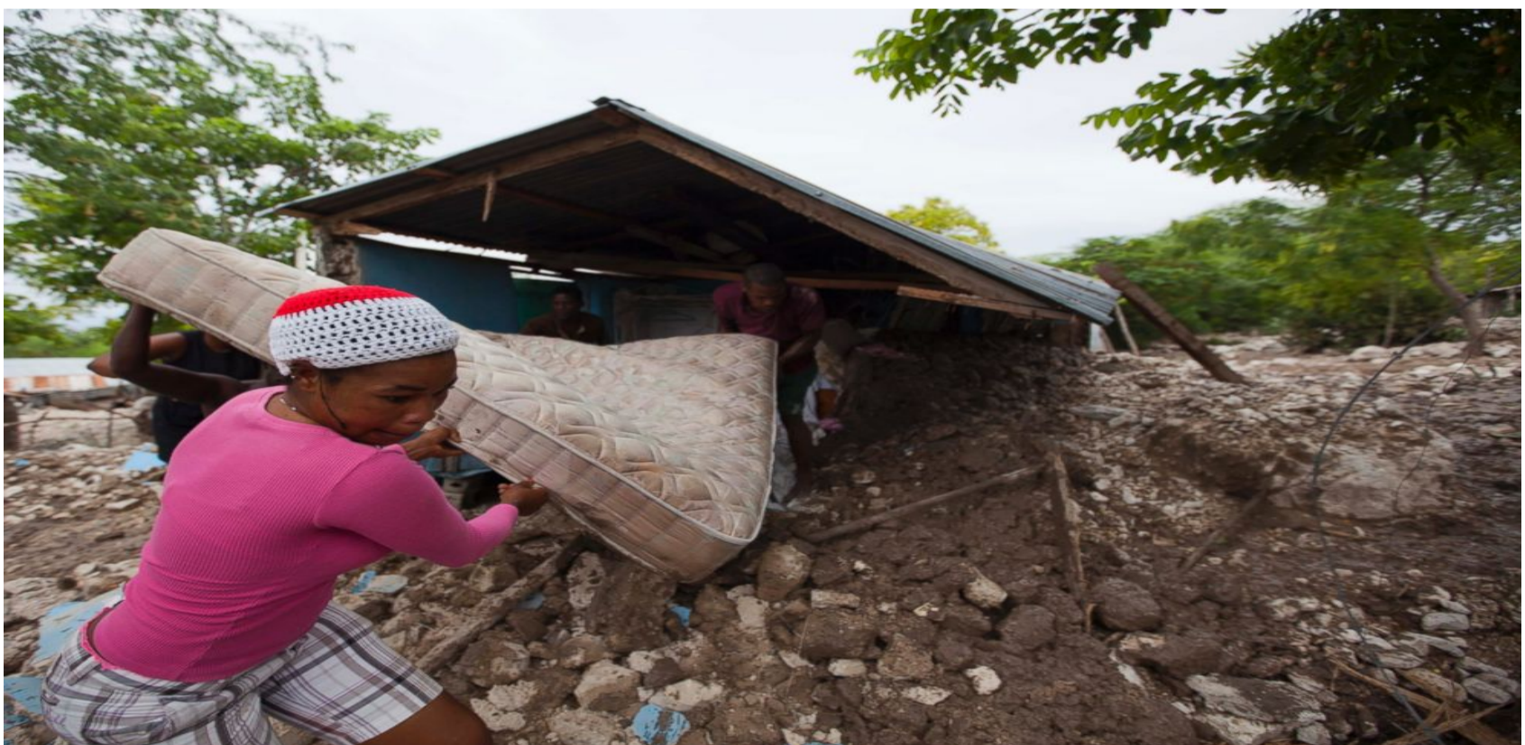
The Hurricane also affected Haiti, causing mudslides after heavy rains on Saturday 29 August 2015