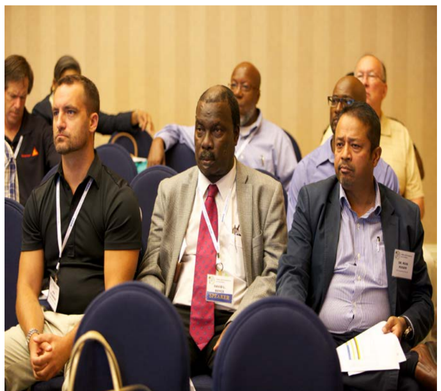
Participants at the Technical Sessions