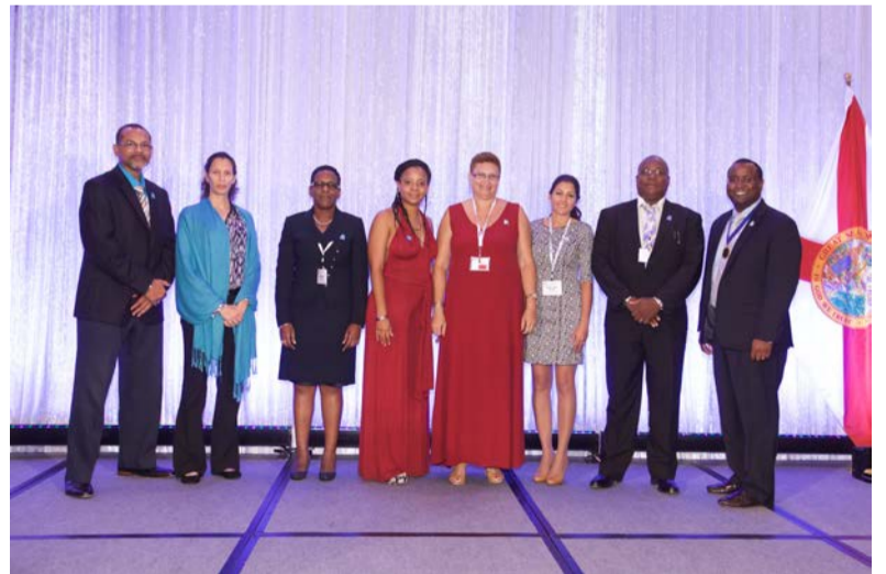
CWWA 2015-2016 Executive Board of Directors

We would like to welcome our newly appointed members and to reaffirm our commitment to working with our Executive as they carry forward the work of the CWWA throughout the Caribbean and beyond.