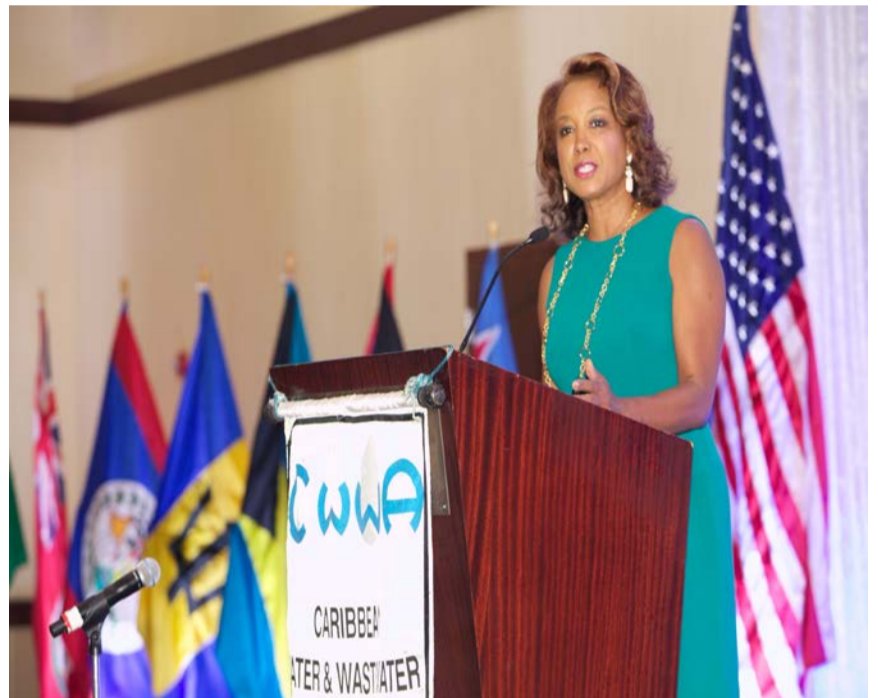
Mrs. Jennifer Carroll, Former Lieutenant Governor, United States Navy