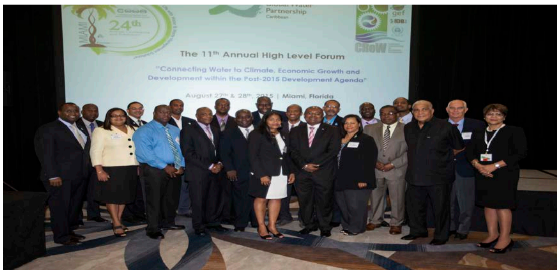
Caribbean Ministers / Representatives Responsible for Water