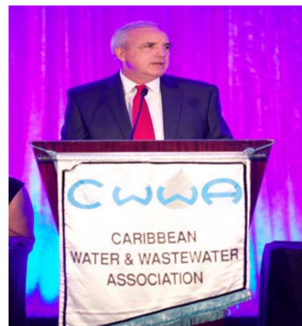
Mayor Miami-Dade County, Carlos Gimenez