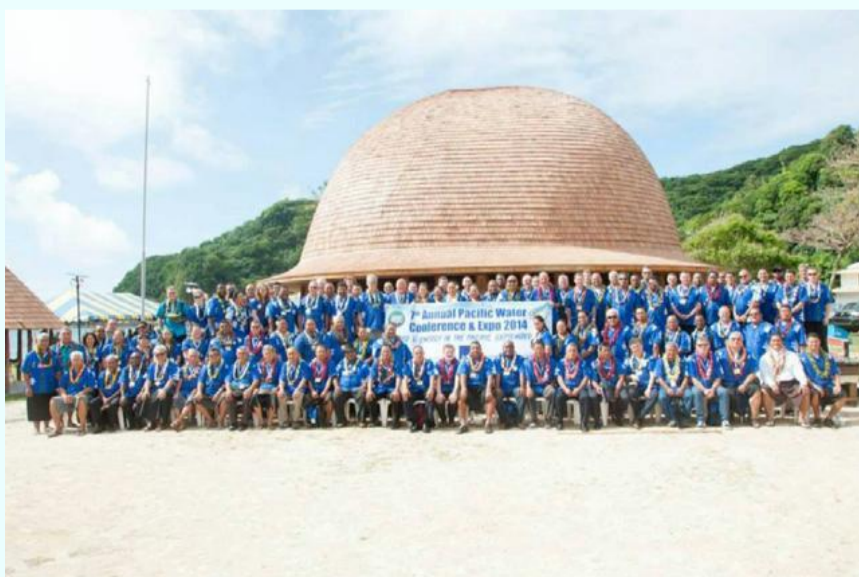
Welcoming Ceremony of the 7th Annual Pacific Water and Wastes Association Conference and Expo in American Samoa

The collaboration between organizations has fostered coordination between the Caribbean Development Bank and the Asian Development Bank, through the recognition that Small Islands Developing States around the world have the opportunity to share experience and expertise in the management of water and waste in their respective geographic regions.