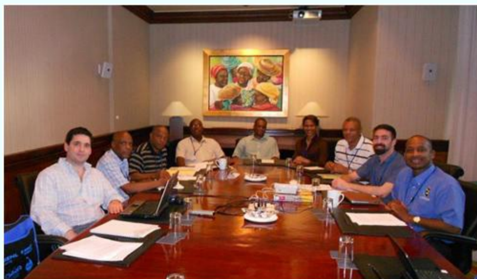
The 1st Meeting of the Steering Committee of the Cari-WOP in Barbados

A Sub-Platform of WOP-LAC, Cari-WOP held its first Executive Committee meeting in Barbados in 2013 and a benchmarking session for Caribbean operators. The Secretariat of Cari-WOP is hosted jointly by the Caribbean Water and Wastewater Association and CAWASA.