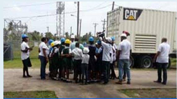
School children on tour at the GPL's Canefield Power Station in Berbice