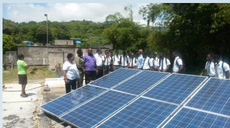
CWWA-Grenada officials explains the Solar PV Systems to the students

In keeping with the 2014 Theme of UN World Water Day “Water and Energy”, CWWA Grenada Chapter organized a technical presentation and tour of the NAWASA’s Mamma Cannes Water Treatment Plant to four secondary schools. The students learned that the Mama Cannes Water Treatment Plant was commissioned in 1985 by National Water and Sewerage Authority Grenada and the plant serves the communities of Mama Cannes, Crochu, Grand Bacolet to Petit