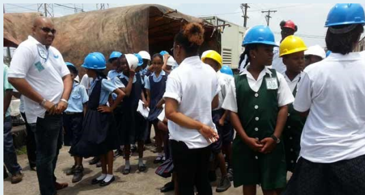
School children at GWI's Water Treatment facility in New Amsterdam, Berbice

Guyana Water Inc (GWI) and Guyana Power and Light Inc. (GPL), in observance of World Water Day 2014, partnered and hosted a tour of Berbice facilities of the two public utilities. It was part of their educational drive when they took 24 students from three different schools to visit the operations of both companies in the 'Ancient County'. The children were from Success Elementary and Monar Educational Institute in Georgetown and School of the Nations in New Amsterdam, Berbice. They first visited GWI's Water Treatment Plant in New Amsterdam, where they were guided around the sprawling premises by managers.