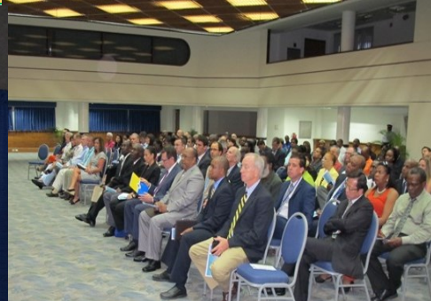
The Audience at the conference Opening Ceremony