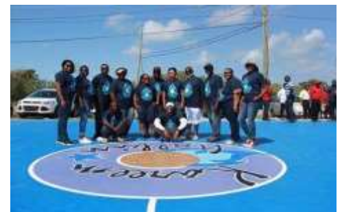
PROVO in the Community- Restoration of Kareem Walkin Basketball court May 2018

My boss, who was on his way, radioed ahead to stress that we needed to urgently close the valve on the cracked pump before the auto-shutdown fail-safe killed the entire lift station. I proceeded to wade through the rising sewage. The other staffer refused to join me. Once I reached the leaking pump and proceeded to shut it down, I noticed, much to my alarm, that the shut-off wheel was not attached but submerged on the floor! My boss went on to conclude that if I had not done my rounds and braved self-baptism that night, the outcome would have been completely different!