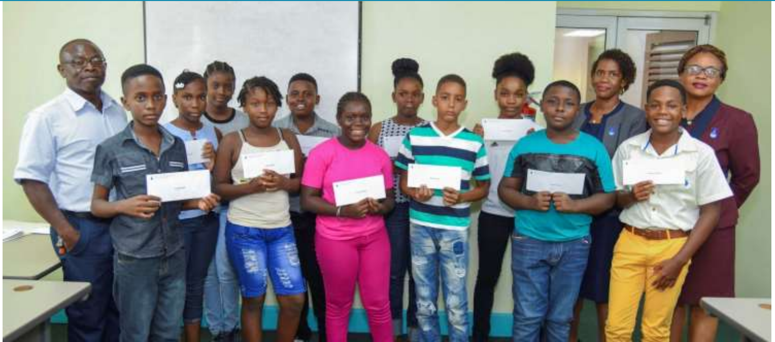
Central Water & Sewerage Authority, St. Vincent and the Grenadines' Scholarships and Bursaries Handing Over Ceremony