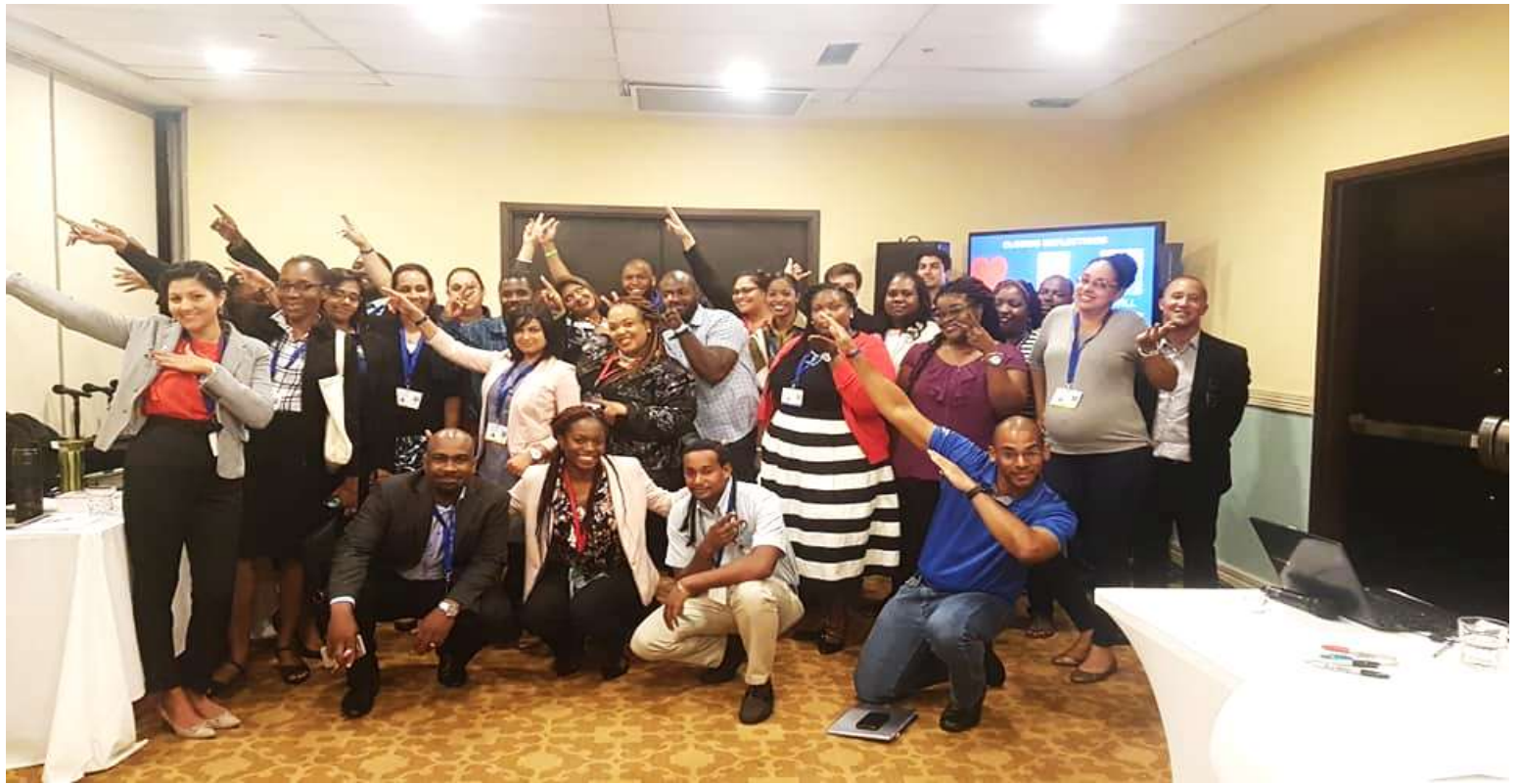
CWWA Young Professionals Forum 2018