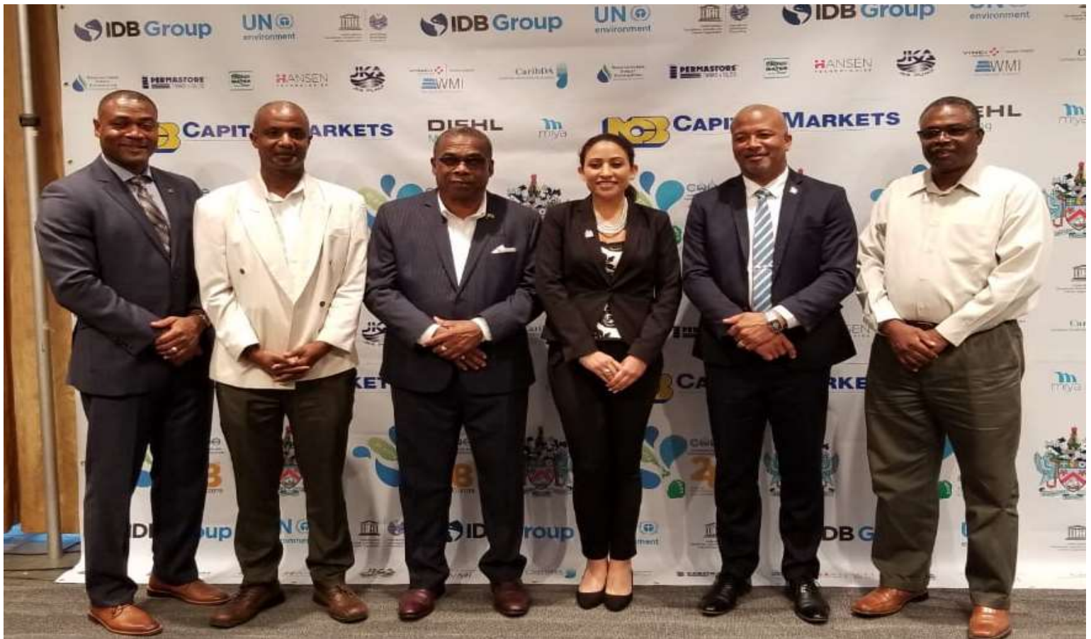
CWWA 28th Annual Conference and Exhibition Media Launch