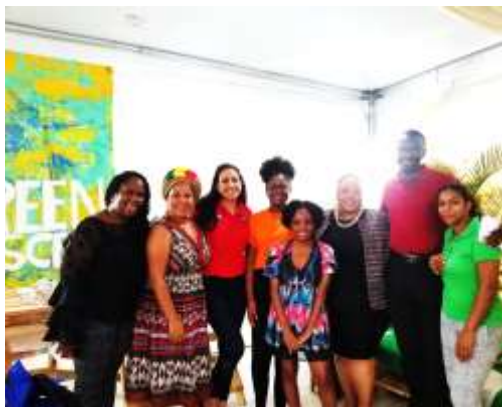
CWWA participates in Carifesta XIV