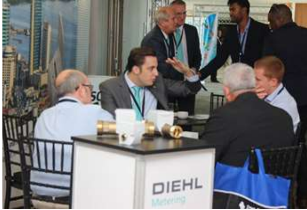
DIEHL Metering at CWWA Conference and Exhibition 2017

metering through to energy services. Diehl Metering provides smart metering solutions to utilities companies through