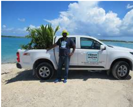
Tree Planting for Drinking Water Week 2019

to suit actual needs. Thanks to more than 20 years of experience with the company's own radio technology, utilities are already perfectly equipped for smart metering as an important component of smart city concepts.