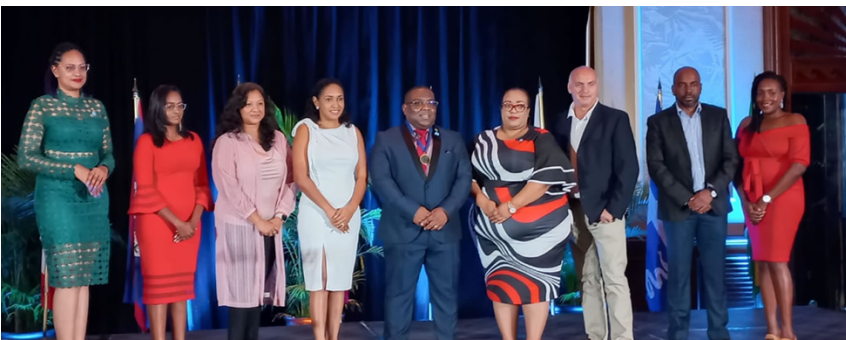
CWWA Board of Directors