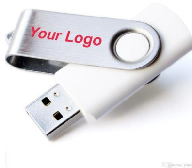
Sample Conference USBs (final product may vary)