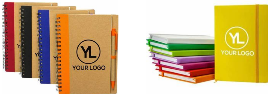
Sample Conference Notebook (final product may vary)