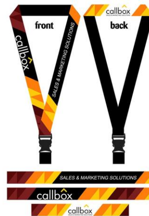
Sample Conference Lanyards (final product may vary)