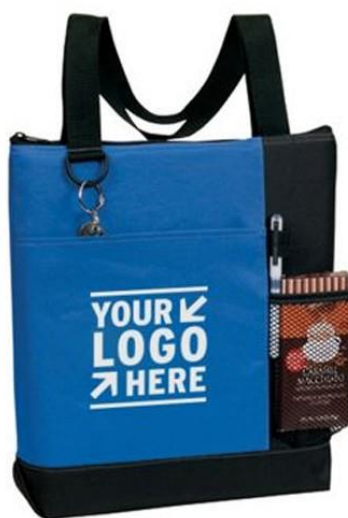
Sample Conference Bag (final product may vary)