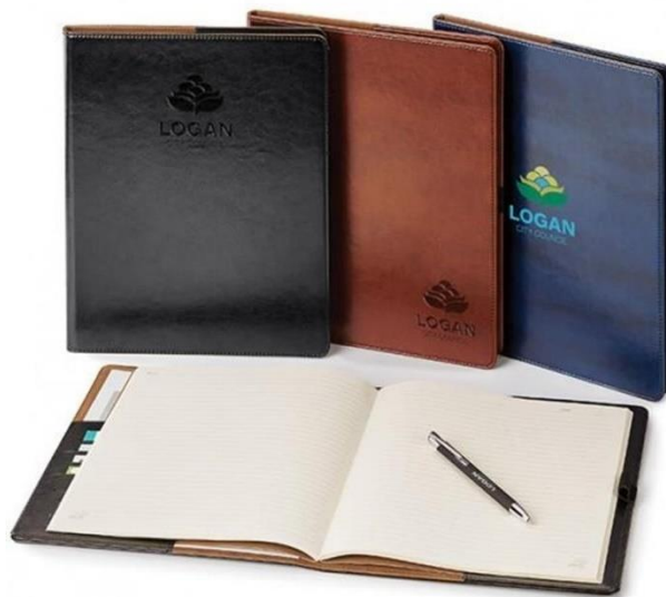
Sample Ministerial Portfolio (final product may vary)