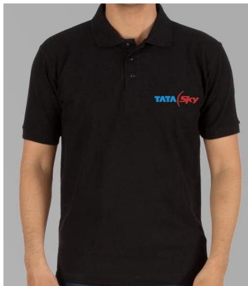
Sample Conference Polo (final product may vary)