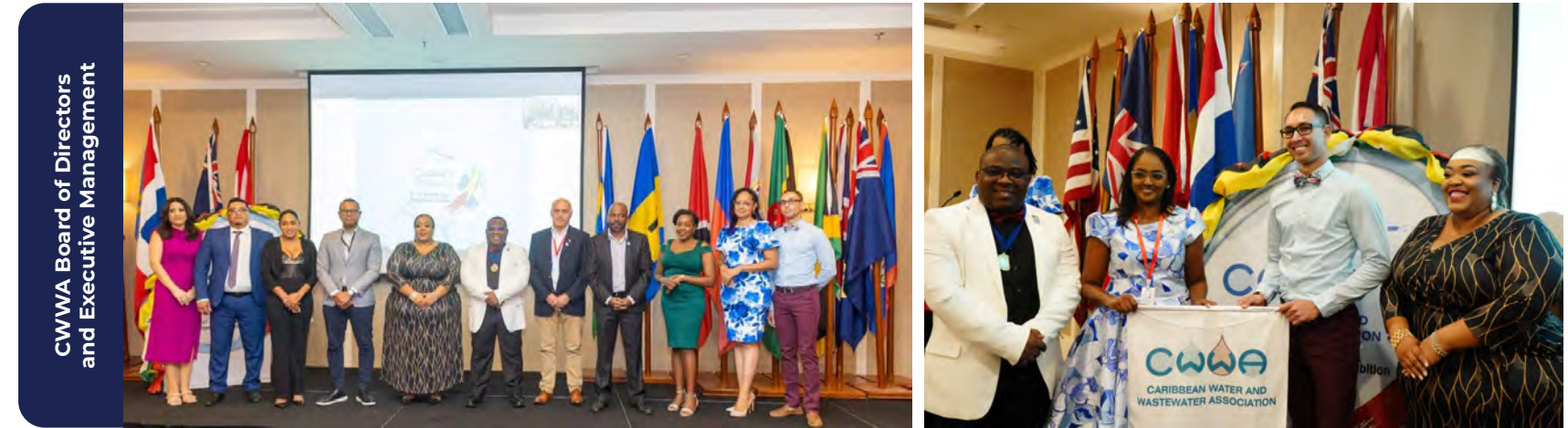
CWWA Board of Directors and Executive Management