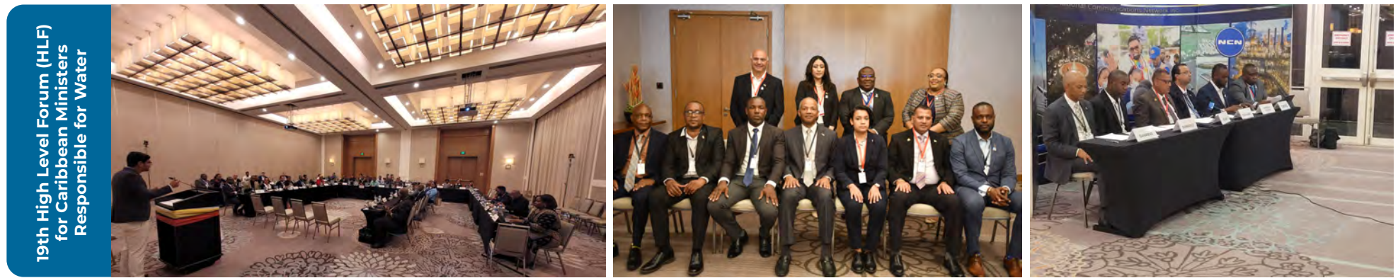
19th High Level Forum (HLF) for Caribbean Ministers Responsible for Water

On October 25th 2023, the 19th High Level Forum (HLF 19) of Caribbean Ministers Responsible for Water concluded with the official signing of the 'Declaration of Georgetown'. This regional agreement is a crucial step in reaffirming the commitment to action for the Caribbean, aligned with ongoing initiatives in the region including the Regional Strategic Action Plan for Governance and Building Climate Resilience in the Caribbean Water Sector (RSAP) and the Caribbean Water Utilities Insurance Collective-Segregated Portfolio (CWUIC-SP).